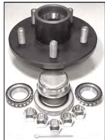
5-LUG HUB KIT