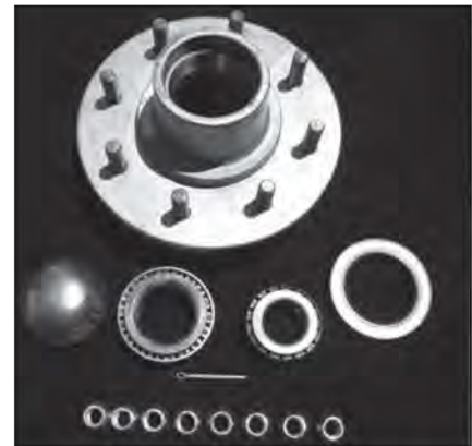
8-LUG HUB KIT