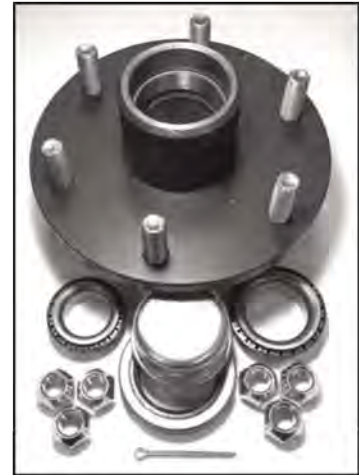
6-LUG HUB KIT