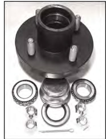
4-LUG HUB KIT