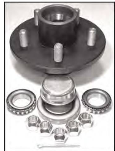
5-LUG HUB KIT