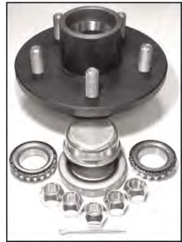
5-LUG HUB KIT