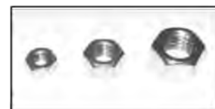
GALVANIZED HEX NUTS