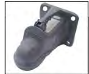
FLAT PLATE COUPLER