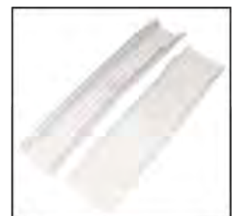
HULL & TORSION KEEL PADS